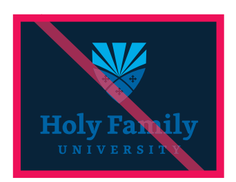
Do NOT place the logo on a background that reduces its legibility. Use the white logo on dark backgrounds.