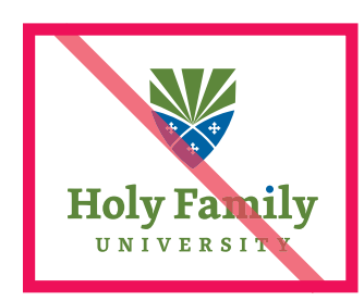
Do NOT change the color of the logo.

The integrity of the logo must be retained at all times. Do not stretch, condesnse, or otherwise abstract the logo. Any modification of the logo diminishes the impact. Some common misues are shown here. Please contact the Marketing & Communications office at communications@holyfamily.edu.