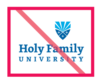
Do NOT rearrange or alter the symbol and logotype.