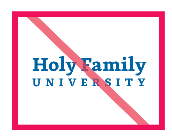
Do NOT use text alone.